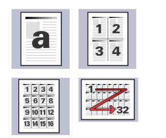
Selectable from [2] [4] [8] [9] [16] or [32]