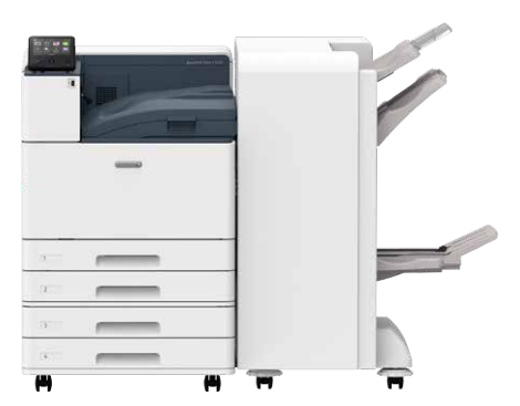
With 2 Tray Module and C3 Finisher with Booklet Maker

Staple capacity of up to 50 / 65 sheets* / Punch* / Saddle Staple / Single Fold