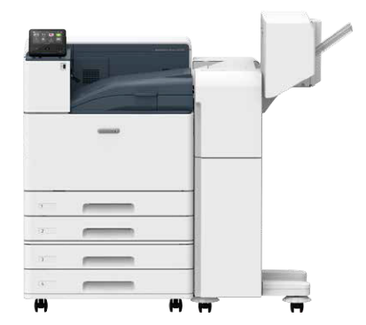
With 2 Tray Module and Finisher-B3 and Booklet Maker Unit Staple capacity of 50 sheets / Punch* / Saddle Staple / Single Fold