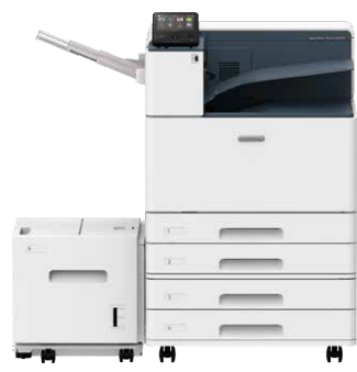
With 2 Tray Module and HCF B1 and Side Tray