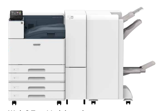
With 2 Tray Module and C3 Finisher with Booklet Maker and Folder Unit CD1

Staple capacity of up to 50 / 65 sheets* / Punch* / Saddle Staple / Single Fold